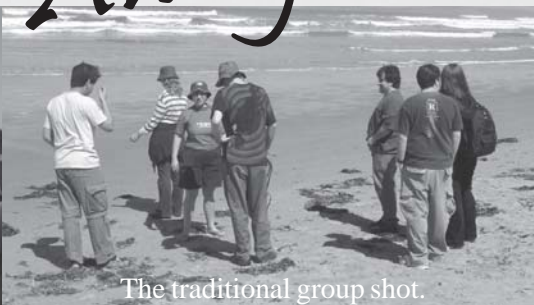
The traditional group shot.